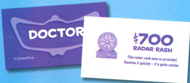
THE DOCTOR WILL EARN $700 FOR SUCCESSFULLY "OPERATING" ON BUZZ LIGHTYEAR'S RADAR RASH.

1. Draw the top Doctor card and read it aloud. The card tells you which part to remove and how much you'll earn for it. See the example below.