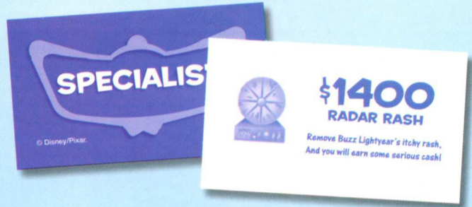
THE SPECIALIST WILL EARN $1400 (TWICE THE DOCTOR FEE) FOR SUCCESSFULLY REMOVING THE RADAR RASH.

Now all players look at their Specialist cards. The player with the Specialist card for that "operation" now tries to remove the part for twice the payment! See the example below.